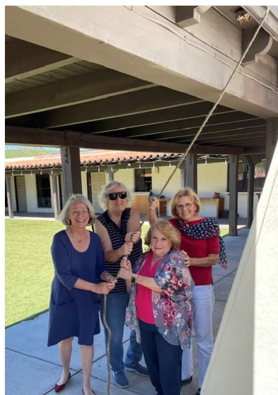
Constitution Day bell ringers