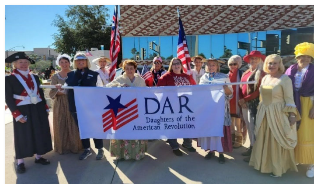
Tucson Chapter well-represented at the Veterans Day Parade