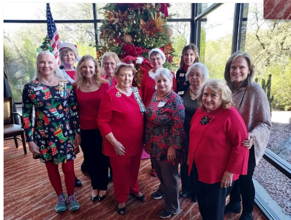
Tucson Chapter Board Members celebrate the season at the December luncheon