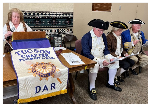
Distinguished guests discussing the Constitution