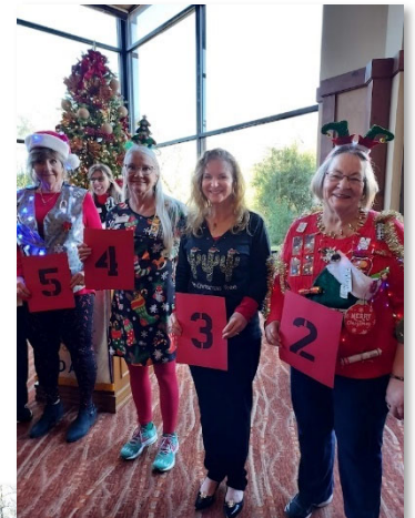
Sweater contest contestants!