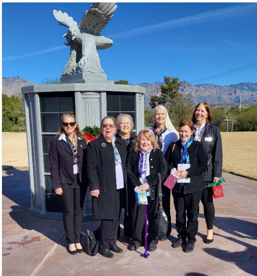
Newly minted Tucson Chapter Choir at their inaugural performance