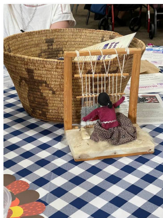
Celebrating American Indian Heritage Month