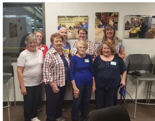
Food Bank Volunteers on DAR Day of Service