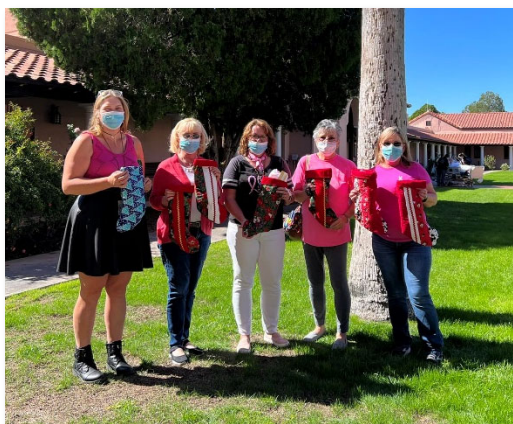
Baby Stocking Shower for Women Veterans