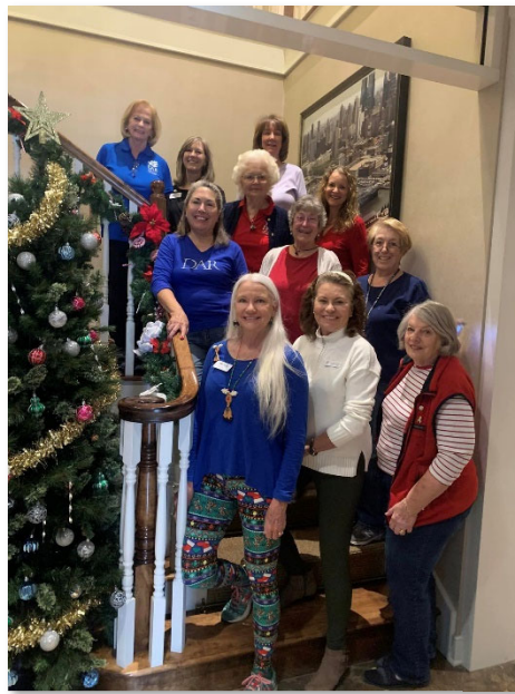
The Onsite Crew at Fisher House