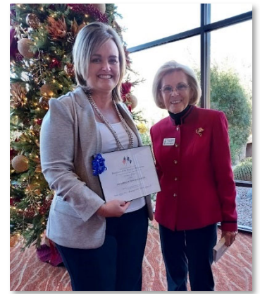
American Flag Certificate presented to the Ventana Canyon properties