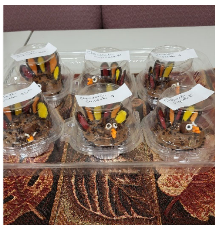
Bake Sale Turkeys just in time for Thanksgiving