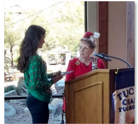
Regent's presentation of support for State C.A.R. President's Project