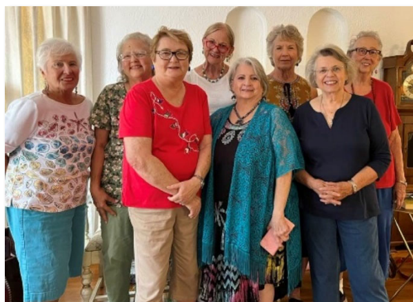
Book Club Regulars Enjoying Another Good Read and Discussion