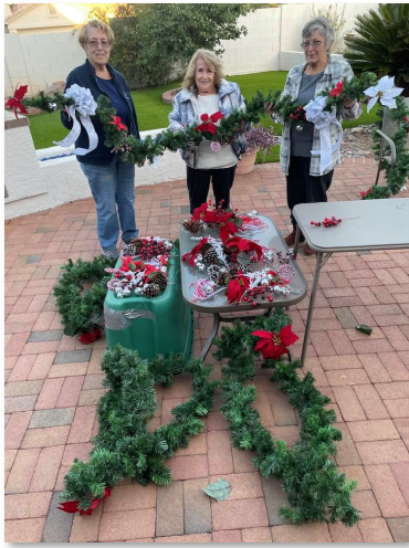
Making Garlands for Fisher House