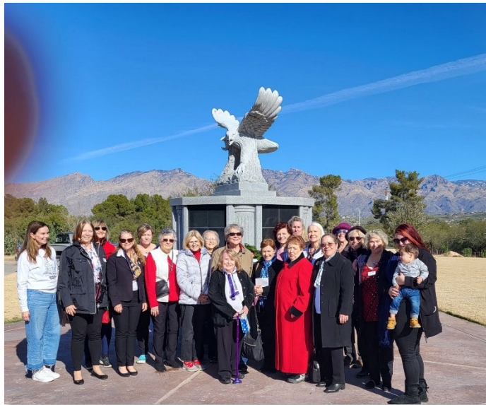
Gathering for the laying of "Wreaths Across America" at East Lawn Palms