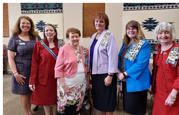
Our State Regent Visited Along with Some of Her Board Members